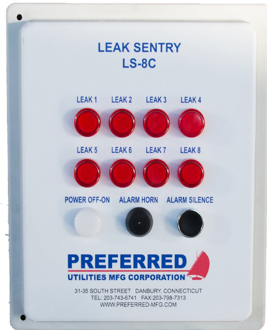
LS-8C LEAK SENTRY